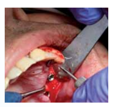
Removing the Long Valve Screw