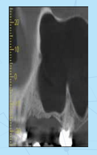
Before the procedure