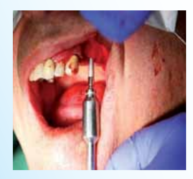
Insert the DIVA