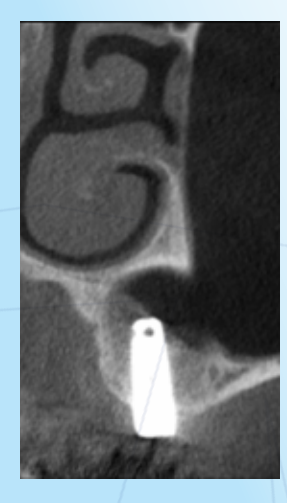
12W post-op implant A 12W post-op implant B